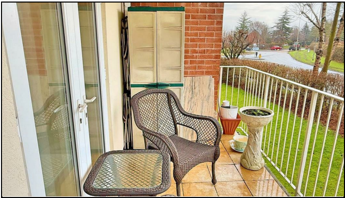
Wyndley Manor, 2 Wyndley Close, Sutton Coldfield, B74 4JD